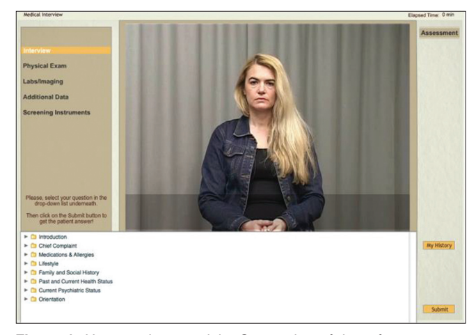
Figure 1: History-taking module. Screenshot of the refugee trauma simulation system illustrating the history-taking interview module

A new, improved feedback module in RT-SIM features two parts: (1) Individualized and automated feedback by the VP herself, giving the refugee patient's perspective on topics such as the level of empathy she perceived, the questions asked and their relevance to the problems she was experiencing. This feedback is given as a video presentation of the VP talking directly to the learner, and it is based on actions taken during the examination, questions asked (based on the type and number of questions and order of asking) and the use of communication skills (i.e., the use of "mirroring" and summarizing of the patient's answers). For every aspect mentioned during the feedback, different video responses were pre-recorded, and the most relevant response was presented to the learner. The feedback from the VP is followed by (2) individualized and automated feedback by a virtual advisor (VA). This formative feedback was presented in text form, and generated once again depending on the learner's management of the case. It gives structured and detailed comments about different actions taken during the medical interview and provides recommendations for improvement if warranted.