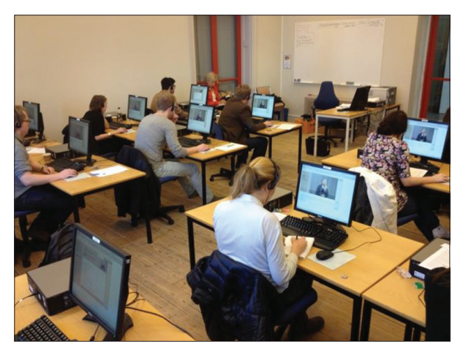
Figure 2: Virtual patients (VPs) system testing set-up. A group of resident psychiatrists interacting with the VP in a quiet computer room

Upon completion of the pre-test questionnaire, the participants obtained access to the VP system and were asked to interact with the VP for about 45 min. During this interactive session they were expected to take a medical history, perform all necessary examinations and provide a summary of their assessment and treatment plan. All of the actions taken by the participants during the session were systematically and chronologically saved in local log files. When this part was completed, the post-test version of KI-VP-LEQ was handed out. This version consists of 25 Likert items that aim to provide insights about